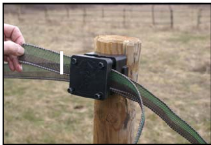
Loosen the lag screws on the tensioner, slightly open the top from the base to slide in the tail of the tape until you meet the mark.