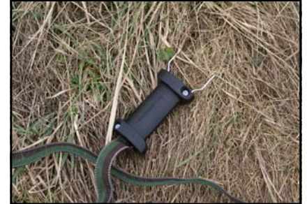
Unhook the gate handle and drop it on the grass leaving the tape loose on the ground.