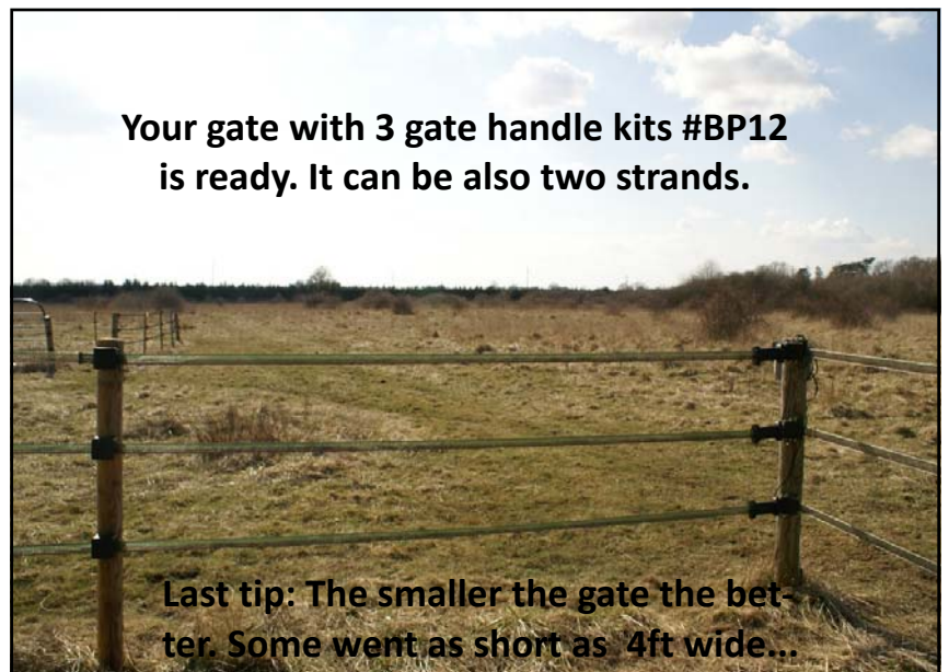
Your gate with 3 gate handle kits #BP12 is ready. It can be also two strands.