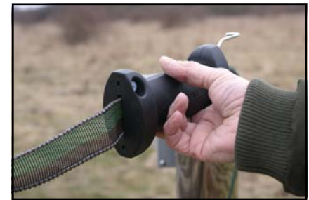
Pick up the gate handle and hook it back on the lugs on the tensioner.