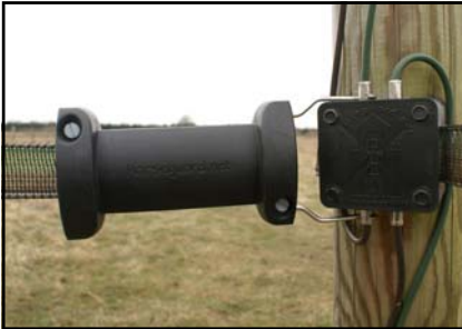
Hook the gate kit to the lugs. Check the color code (green on top)...