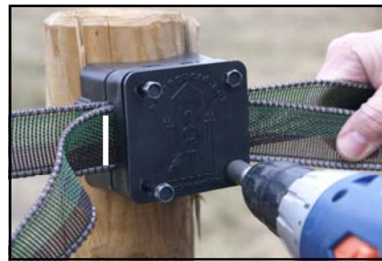
Re-Tension the fence tape and make sure that the two tapes are in a super imposed position. Drill back in the 4 lagbolts.