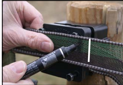
Go back to the other post and measure the tape. Don't over stretch it. Put a mark on the tape. The correct tension will be the width of the block.