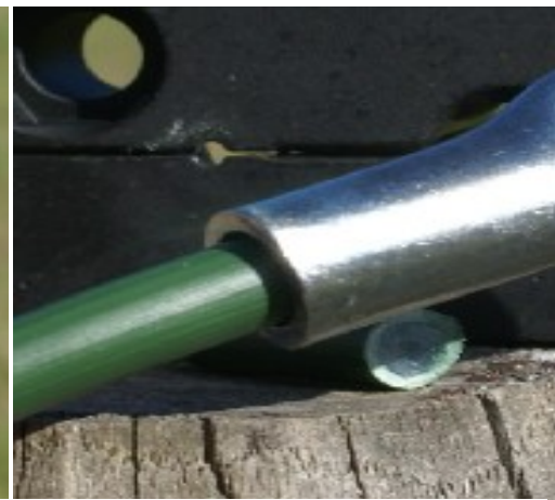
Press the harness of wires so they can slip intirely into the slug Force the cable totaly in