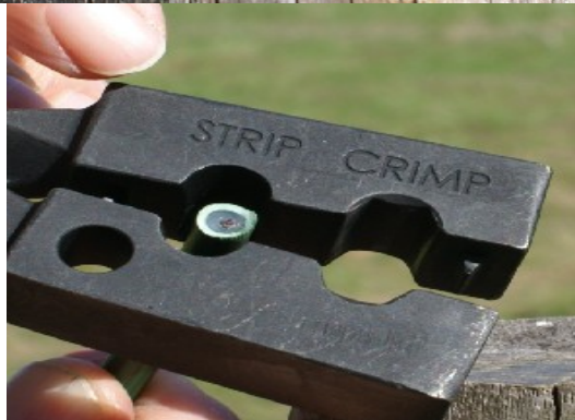
Place it into the jaw of the stripper