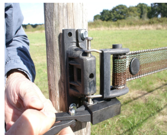
The socket wrench, is handy to tighten a nut.