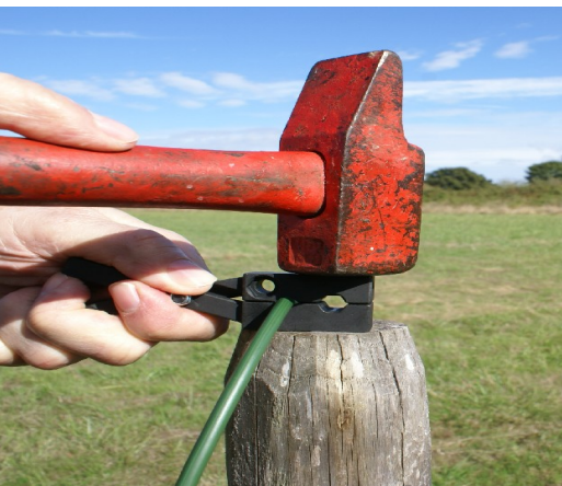
Knock gently to cut the cable