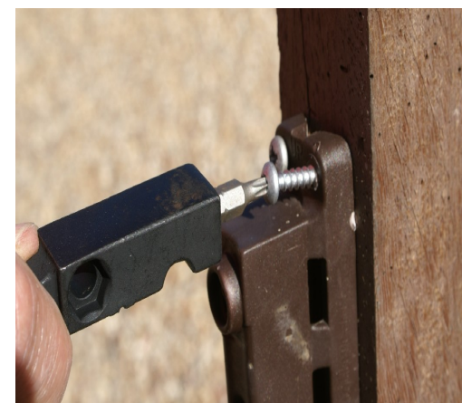
to have a handy screw driver.