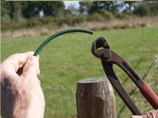
After measuring the necessary wire, cut it.