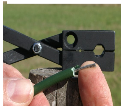
Push the cable on the side of the cable