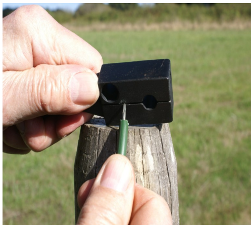
Pull the cable. the tripping is as long as the stripper