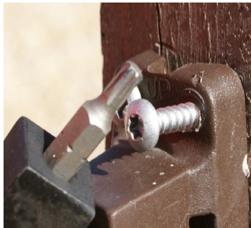
Or Insert the bit into the bit holder