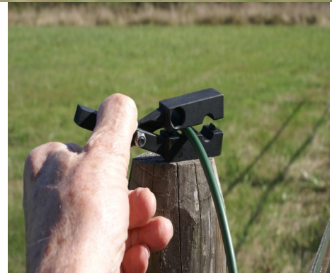
Position the stripper on the top of a strong post