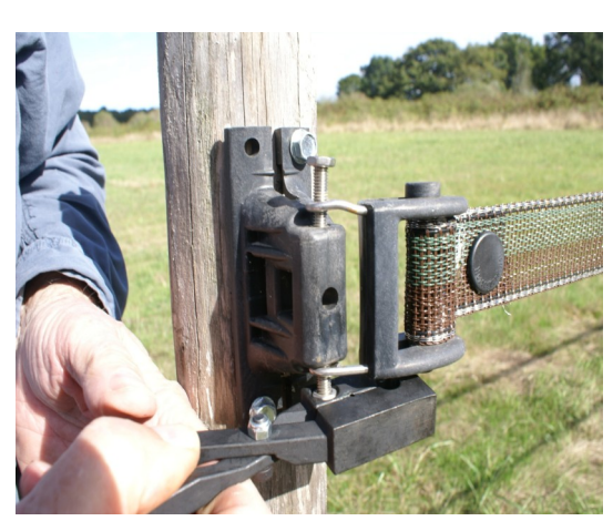
The socket wrench, is handy to tighten a nut.