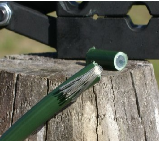
Press the harness of wires so