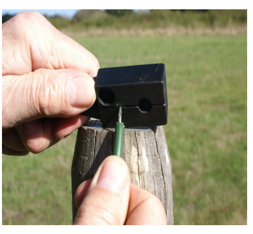
Pull the cable. the tripping is as long as the stripper