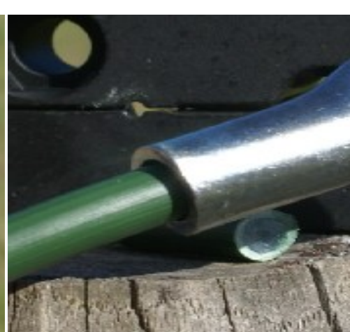
Force the cable totaly in