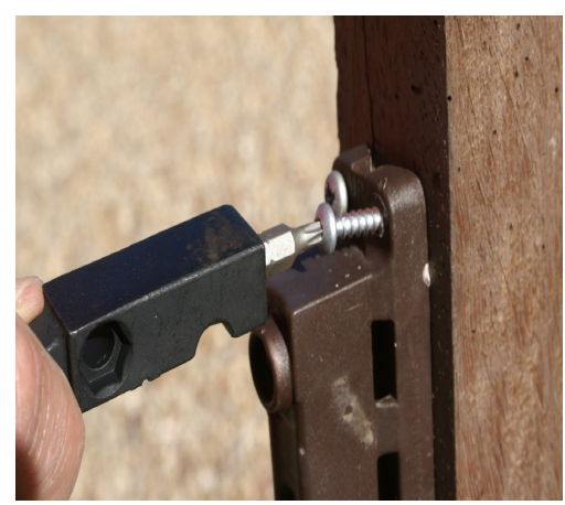
to have a handy screw driver.