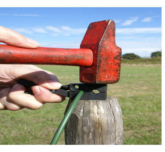
Knock gently to cut the cable