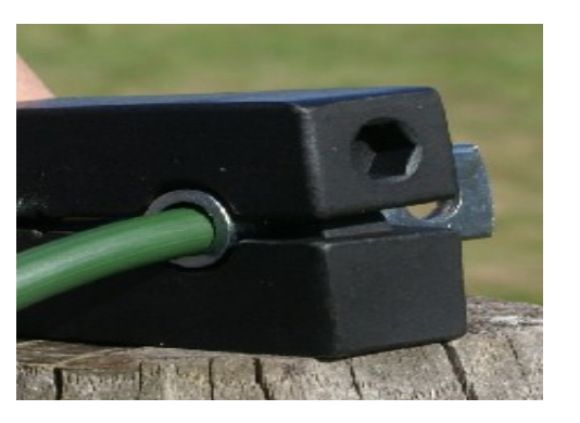
Now place the slug between the jaws of the crimper