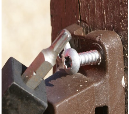
Or Insert the bit into the bit holder