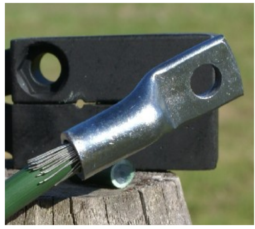
they can slip intirely into the slug