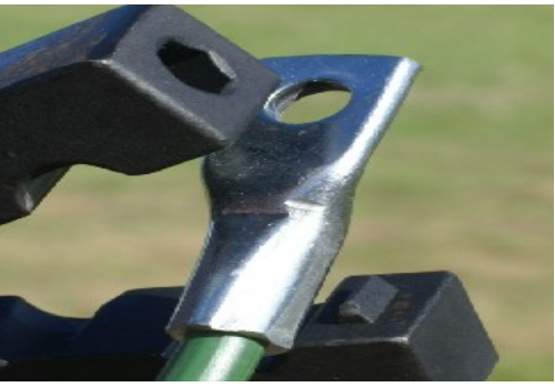
You now have done a professional crimping