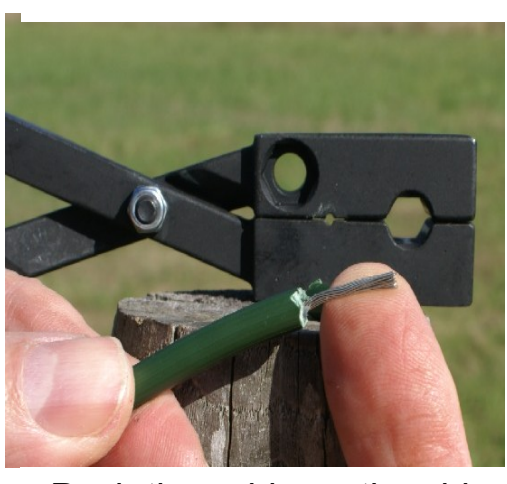
Push the cable on the side of the cable